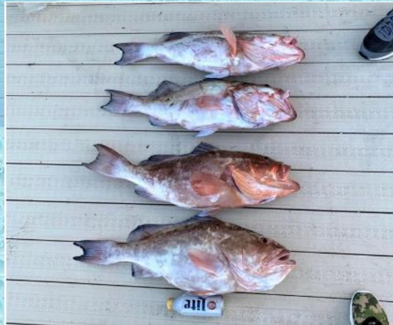
The four biggest Grouper –all over 30".