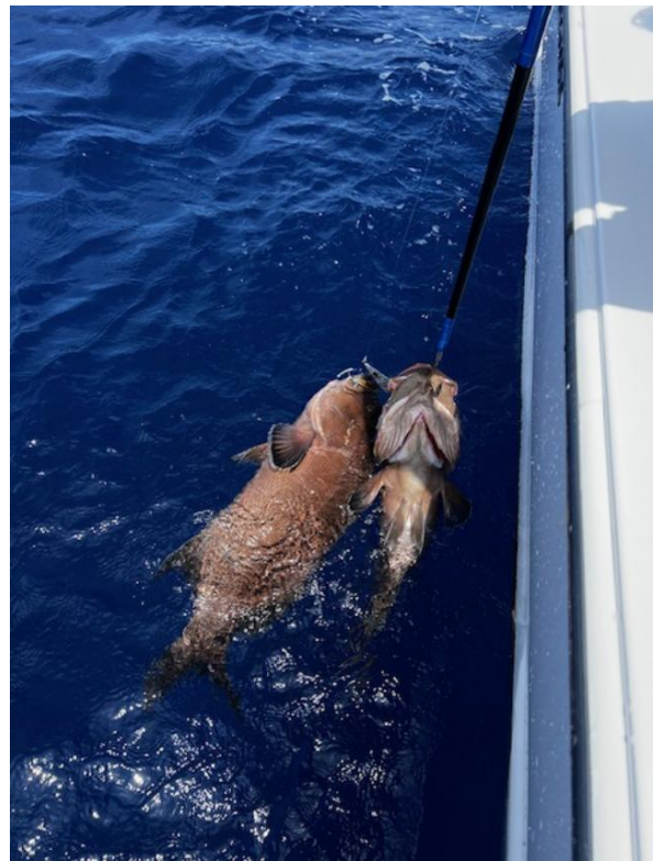
Doubleheader of Scamp Grouper on one slow pitch jig – Pulley Ridge