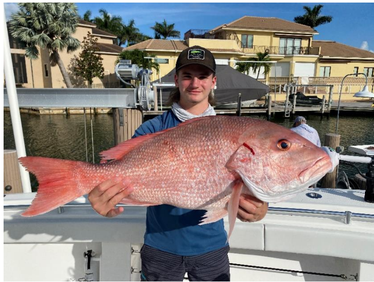
My nephew with his first American Red Snapper