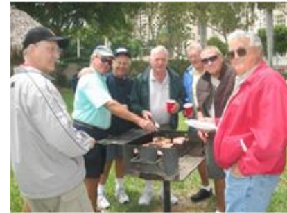
File Photo: Circa 2010

$16 ($21 Guests) Each $21 ($26 Guests) IF RECEIVED after 5/29 NO WALK-INS: We don't buy extra steaks