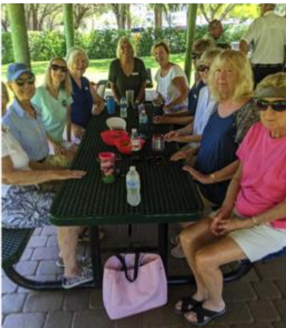
The wives of the intrepid shark anglers