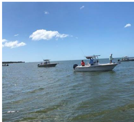
Part of the group with Joe Perino's boat in the foreground