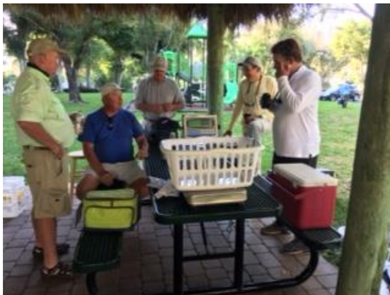
Sheepshead weigh in