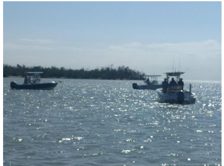
Anglers on the prowl